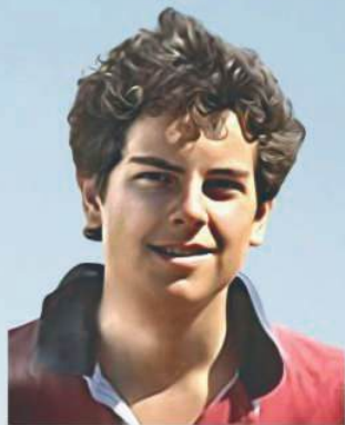
Feast Day Oct 12