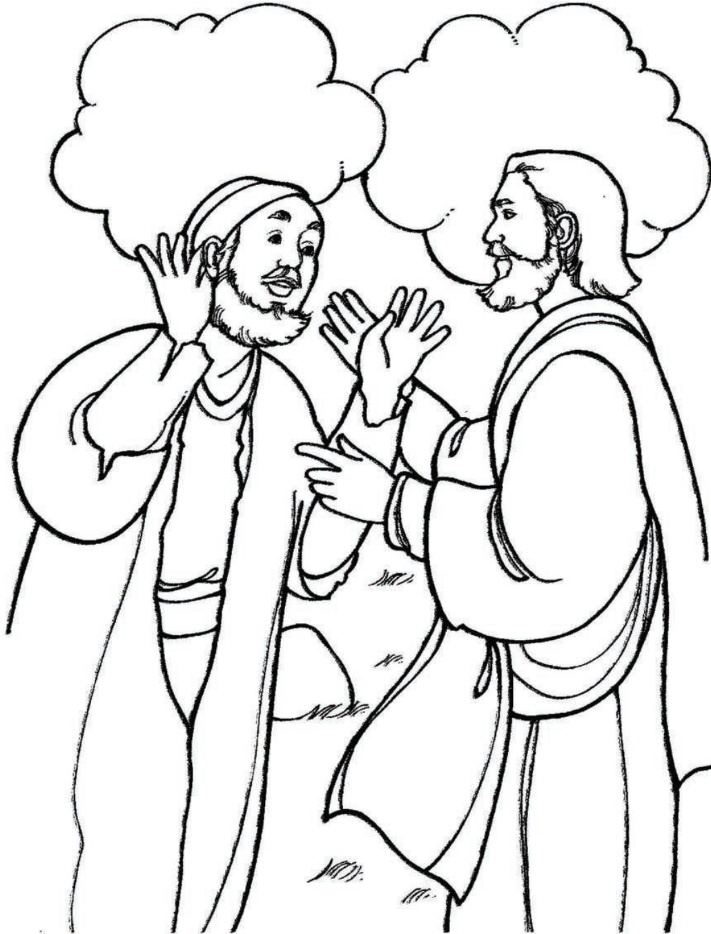
Jesus helps this man speak and hear